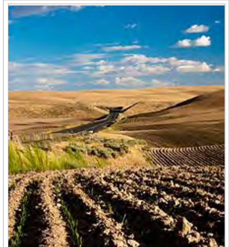
Fields in the Palouse, Washington State

Dryland farmed crops may include winter wheat, corn, beans, Sunflowers or even watermelon. Successful dryland farming is possible with as little as 9 inches (230 mm) of precipitation a year; higher rainfall increases the variety of crops. Native American tribes in the arid Southwest survived for hundreds of years on dryland farming in areas with less than 10 inches (250 mm) of rain. The choice of crop is influenced by the timing of the predominant rainfall in relation to the seasons. For example, winter wheat is more suited to regions with higher winter rainfall while areas with summer wet seasons may be more suited to summer growing crops such as sorghum, sunflowers or cotton. [4]