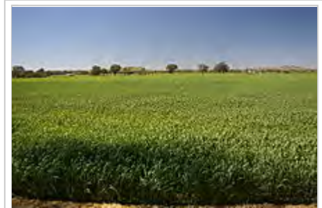
An example of a dryland farming paddock