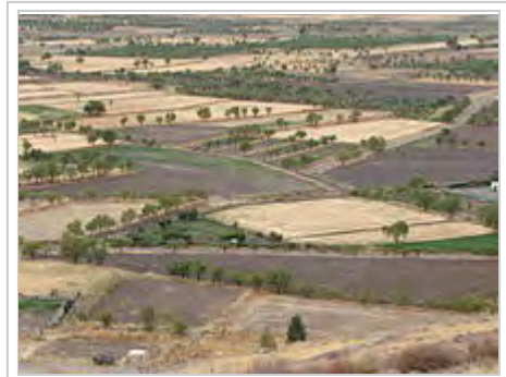
Dryland farming in the Granada region in Spain

Dryland farming and dry farming are agricultural techniques for non-irrigated cultivation of crops. Dryland farming is associated with drylands - dry areas characterized by a cool wet season followed by a warm dry season.