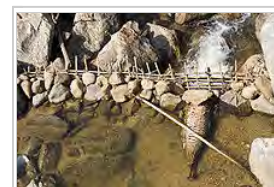
Vietnamese traditional fish trap.

Fishing traps are culturally almost universal and seem to have been independently invented many times. There are essentially two types of trap, a permanent or semi-permanent structure placed in a river or tidal area and pot-traps that are baited to attract prey and periodically lifted. They might have the form of a fishing weir or a lobster trap. A typical trap can have a frame of thick steel wire in the shape of a heart, with chicken wire stretched around it. The mesh wraps around the frame and then tapers into the inside of the trap. When a fish swims inside through this opening, it cannot get out, as the chicken wire opening bends back into its original narrowness. In earlier times, traps were constructed of wood and fibre.