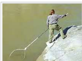
Fishing for salmon with a hand net on the Fraser River, Canada

Fishing nets are meshes usually formed by knotting a relatively thin thread. Between 177 and 180 the Greek author Oppian wrote the Halieutica , a didactic poem about fishing. He described various means of fishing including the use of nets cast from boats, scoop nets held open by a hoop, and various traps "which work while their masters sleep". Ancient fishing nets used threads made from leaves, plant stalk and cocoon silk. They could be rough in design and material but some designs were amazingly close to designs we use today (Parker 2002). Modern nets are usually made of artificial polyamides like nylon, although nets of organic polyamides such as wool or silk thread were common until recently and are still used.