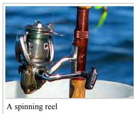
A spinning reel

A fishing reel is a device used for the deployment and retrieval of a fishing line using a spool mounted on an axle. Fishing reels are traditionally used in angling. They are most often used in conjunction with a fishing rod, though some specialized reels are mounted on crossbows or to boat gunwales or transoms. The earliest known illustration of a fishing reel is from Chinese paintings and records beginning about 1195 A.D. Fishing reels first appeared in England around 1650 A.D., and by the 1760s, London tackle shops were advertising multiplying or gear-retrieved reels. Paris, Kentucky native George Snyder is generally given credit for inventing the first fishing reel in America around 1820, a bait casting design that quickly became popular with American anglers.