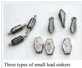
Three types of small lead sinkers

A sinker or plummet is a weight used when angling to force the lure or bait to sink more rapidly or to increase the distance that it may be cast. The ordinary plain sinker is traditionally made of lead. It can be practically any shape, and is often shaped round like a pipe-stem, with a swelling in the middle. However, the use of smaller lead based fishing sinkers has now been banned in the UK, Canada and some states in the USA, [4] since lead can cause toxic lead poisoning if ingested. There are loops of brass wire on either end of the sinker to attach the line. Weights can range from a quarter of an ounce for trout fishing up to a couple of pounds or more for sea bass and menhaden.