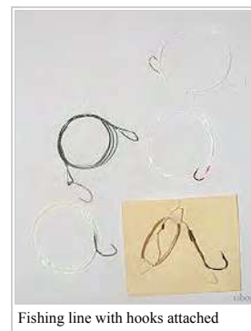
Fishing line with hooks attached

Fishing rods can be contrasted with fishing poles . A fishing pole is a simple pole or stick with a line which is fastened to the tip and suspended with a hooked lure or bait at the other end.