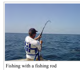
Fishing with a fishing rod