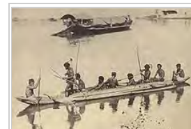
The Filipino Negritos traditionally used bows and arrows to shoot fish in clear water. [8]

A bow or crossbow can be used with arrows in bowfishing.