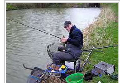
An angler on the Kennet and Avon Canal, England, surrounded by his tackle

The term tackle , with the meaning "apparatus for fishing", has been in use from 1398 AD. [1] Fishing tackle is also called fishing gear . However the term fishing gear is more usually used in the context of commercial fishing, whereas fishing tackle is more often used in the context of recreational fishing. For this reason, this article covers equipment used by recreational fishermen.