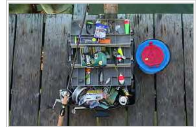
Typical tackle box with rod and bait bucket

Fishing tackle boxes have for many years been an essential part of the anglers equipment. Fishing tackle boxes were originally made of wood or wicker and eventually some metal fishing tackle boxes were manufactured. The first plastic fishing tackle boxes were manufactured by Plano in response to the need for a product that didn't rust. Early plastic fishing tackle boxes were similar to tool boxes but soon evolved into the hip roof cantilever tackle boxes with numerous small trays for small tackle. These types of tackle boxes are still available today but they have the disadvantage that small tackle gets mixed up. Fishing tackle boxes have also been manufactured so the drawers themselves become small storage boxes, each with their own lids. This prevents small tackle from mixing, and can turn each drawer into a stand-alone container which can be used to carry small tackle to a rod some distance from the main tackle box.