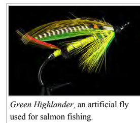
Green Highlander, an artificial fly used for salmon fishing.

Many people prefer to fish solely with lures, which are artificial baits designed to entice fish to strike. The artificial bait angler uses a man-made lure that may or may not represent prey. The lure may require a specialised presentation to impart an enticing action as, for example, in fly fishing. Recently, electronic lures have been developed to attract fish. Fishermen have also begun using plastic bait. A common way to fish a soft plastic worm is the Texas rig.