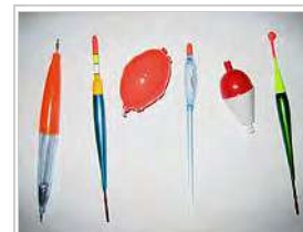
Different types of fishing floats.

Other devices which are widely used as bite indicators are floats which float in the water, and dart about if a fish bites, and quiver tips which are mounted onto the tip of the fishing rod. Bite alarms are electronic devices which bleep when a fish tugs a fishing line. Whereas floats and quiver tips are used as visual bite detectors, bite alarms are audible bite detectors.