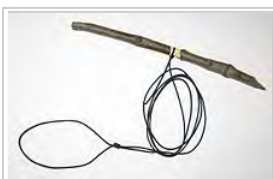
Simple fish stringer for spearfishing

A fish stringer is a line of rope or chain along which a fisherman can string fish that have been caught so they can be immersed and kept alive in water. [14]