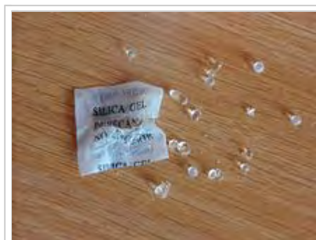
Silica gel in a sachet or porous packet

Canisters are commonly filled with silica gel and other molecular sieves used as desiccant in drug containers to keep contents dry.