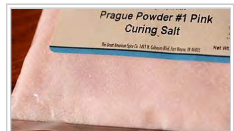
Bag of Prague powder #1, also known as "curing salt" or "pink salt". It is typically a combination of salt and sodium nitrite, with the pink color added to distinguish it from ordinary salt.

Smoking is used to lengthen the shelf life of perishable food items. This effect is achieved by exposing the food to smoke from burning plant materials such as wood. Smoke deposits a number of pyrolysis products onto the food, including the phenols syringol, guaiacol and catechol. [6] These compounds aid in the drying and preservation of meats and other foods. Most commonly subjected to this method of food preservation are meats and fish that have undergone curing. Fruits and vegetables like paprika, cheeses, spices, and ingredients for making drinks such as malt and tea leaves are also smoked, but mainly for cooking or flavoring them. It is one of the oldest food preservation methods, which probably arose after the development of cooking with fire.