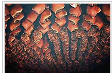
Smoked ham in a smokehouse in Schleswig-Holstein, Germany