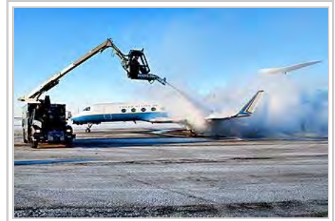
A U.S. Gulfstream G550 gets de-iced before departing Alaska in January

De-icing operations for airport pavement (runways, taxiways, aprons, taxiway bridges) may involve several types of liquid and solid chemical products, including propylene glycol, ethylene glycol and other organic compounds. Chloride-based compounds (e.g. salt) are not used at airports, due to their corrosive effect on