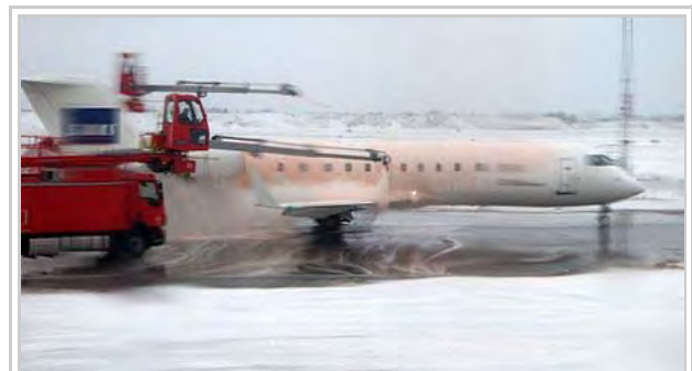
An aircraft being de-iced at Copenhagen Airport with an orange-colored fluid

Methanol de-ice fluid has been employed for years to de-ice small wing and tail surfaces of small to medium-sized general aviation aircraft and is usually applied with a small hand-held sprayer. Methanol can only remove frost and light ground ice prior to flight.