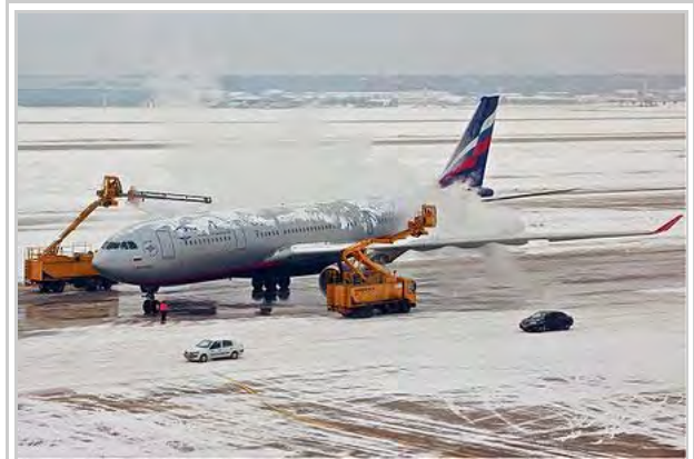
An Aeroflot Airbus A330 being de-iced at Sheremetyevo International Airport.