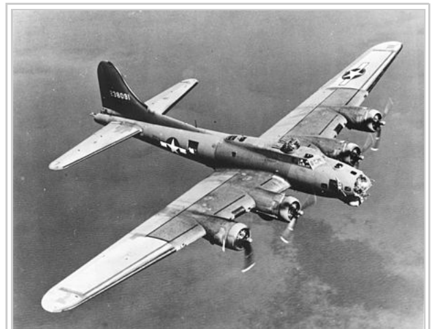
B-17 Flying Fortress. The black strips on the leading edges of the tail, stabilizers and wing are deicing boots made of rubber.

Many modern civil fixed-wing transport aircraft use anti-ice systems on the leading edge of wings, engine inlets and air data probes using warm air. This is bled from engines and is ducted into a cavity beneath the surface to be anti-iced. The warm air heats the surface up to a few degrees above 0 °C (32 °F), preventing ice