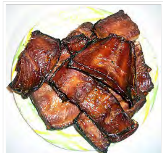
Hot-smoked chum salmon