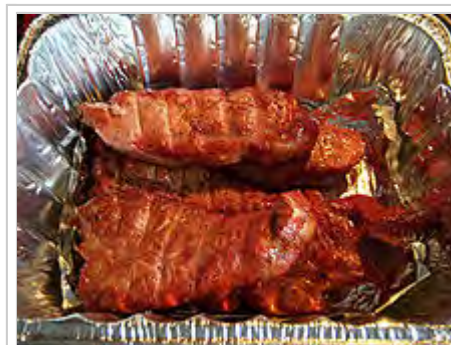
Hickory-smoked country-style ribs.

Cellulose and hemicellulose are aggregate sugar molecules; when burnt, they effectively caramelize, producing carbonyls, which provide most of the color components and sweet, flowery, and fruity aromas. Lignin, a highly complex arrangement of