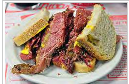
A Montreal Smoked Meat Sandwich, a well-known Canadian dish.