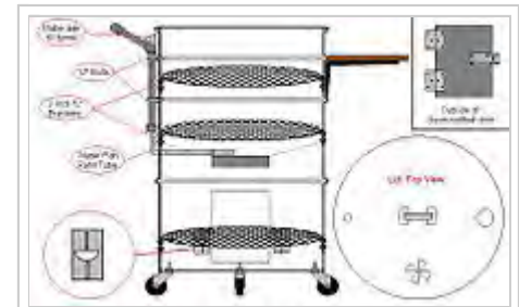
A diagram of a typical upright drum smoker

The upright drum smoker (also referred to as an ugly drum smoker or UDS) is exactly what its name suggests; an upright steel drum that has been modified for the purpose of pseudo-indirect hot smoking. There are many ways to accomplish this, but the basics include the use of a complete steel drum, a basket to hold charcoal near the bottom, and cooking rack (or racks) near the top; all covered by a vented lid of some sort. They have been built using many different sizes of steel drums, such as 30 US gallons (110 l; 25 imp gal), 55 US gallons (210 l; 46 imp gal), and 85 US gallons (320 l; 71 imp gal) for example, but the most popular size is the common 55 gallon drum.