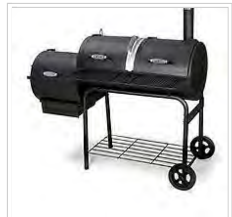
An example of a common offset smoker.

The heat and smoke cook and flavor the meat before escaping through an exhaust vent at the opposite end of the cooking chamber. Most manufacturers' models are based on this simple but effective design, and this is what most people picture when they think of a "BBQ smoker." Even large capacity commercial units use this same basic design of a separate, smaller fire box and a larger cooking chamber.