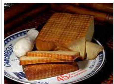
Smoked Gruyère cheese