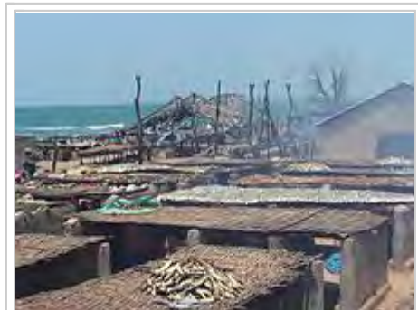
Fish being smoked in Tanji, The Gambia