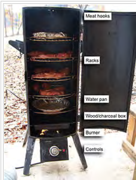
A diagram of a propane smoker, loaded with country style ribs and pork loin in foil.

provides the smoke. The steel box has few vent holes, on the top of the box only. By starving the heated wood of oxygen, it smokes instead of burning. Any combination of woods and charcoal may used. This method uses less wood.