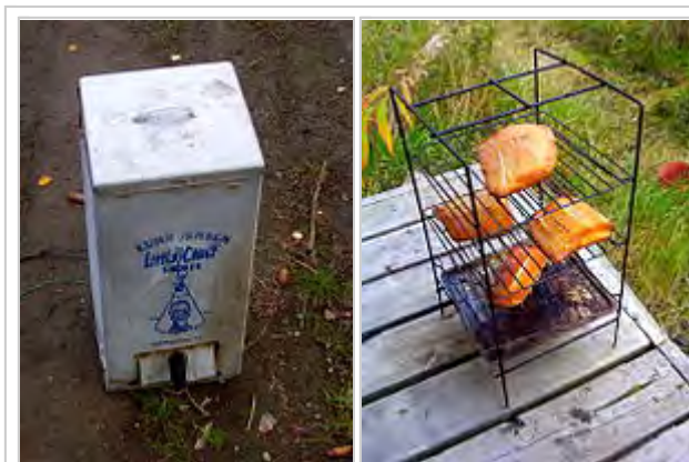
A "Little Chief" home smoker and racks with hot smoked Pacific halibut

Smokehouse temperatures for cold smoking are typically done between 20 to 30 °C (68 to 86 °F). [6] In this temperature range, foods take on a smoked flavor, but remain relatively moist. Cold smoking does not cook foods. Meats should be fully cured before cold smoking. [6] Cold smoking can be used as a flavor enhancer for items such as chicken breasts, beef, pork chops, salmon, scallops, and steak. The item is hung first to develop a pellicle, then can be cold smoked for just long enough to give some flavor. Some cold smoked foods are baked, grilled, steamed, roasted, or sautéed before eating.