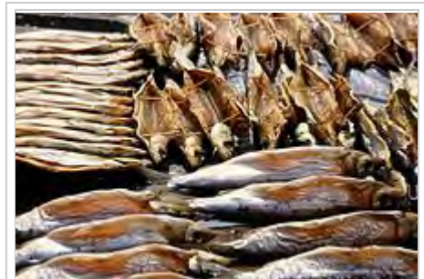
Smoked omul fish, endemic to Lake Baikal in Russia, on sale at Listyanka market.

Some of the more common smoked foods and beverages include: