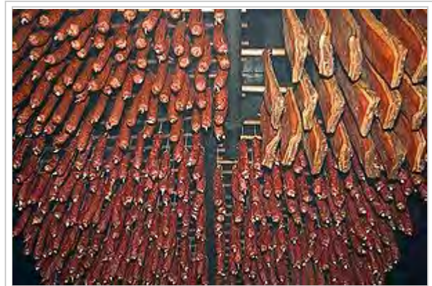
Meat hanging inside a smokehouse in Switzerland.

The smoking of food directly with wood smoke is known to contaminate the food with carcinogenic polycyclic aromatic hydrocarbons. [2]