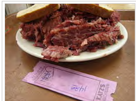
Pastrami, a smoked and cured beef product