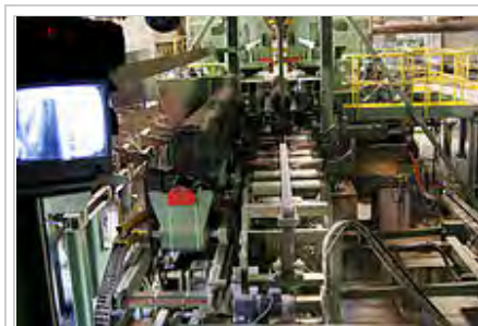
A modern sawmill

In topographically severe forested terrain, proper forestry is important for the prevention or minimization of serious soil erosion or even landslides. In areas with a high potential for landslides, forests can stabilize soils and prevent property damage or loss, human injury, or loss of life.