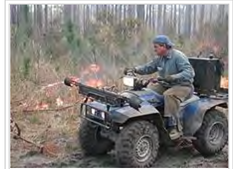
Prescribed burning is used by foresters to reduce fuel loads

The International Union of Forest Research Organizations is the only international organization that coordinates forest science efforts worldwide. [32]