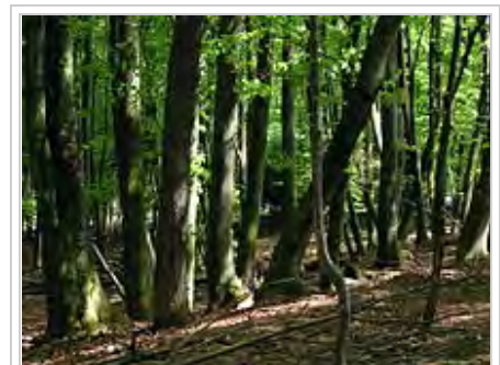
A deciduous beech forest in Slovenia