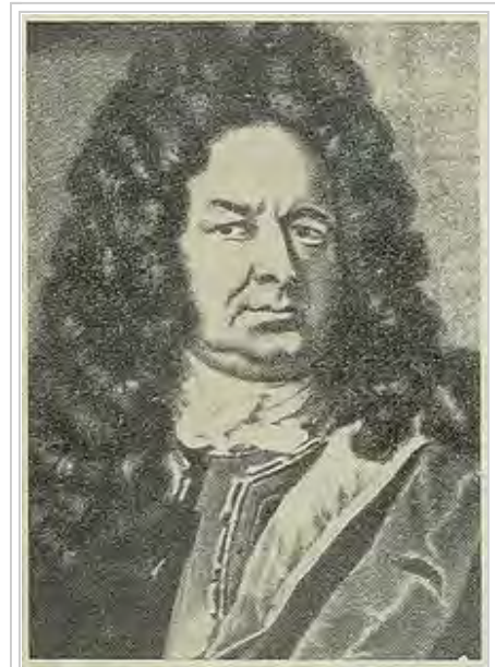
Hans Carl von Carlowitz