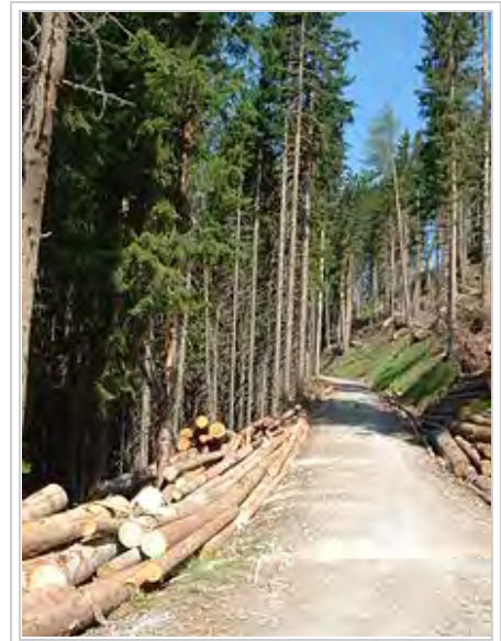
Forestry work in Austria

Modern forestry generally embraces a broad range of concerns, in what is known as multiple-use management, including the provision of timber, fuel wood, wildlife habitat, natural water quality management, recreation, landscape and community protection, employment, aesthetically appealing landscapes, biodiversity management, watershed management, erosion control, and preserving forests as 'sinks' for atmospheric carbon dioxide. A practitioner of forestry is known as a forester. Other terms are used a verderer and a silviculturalist being common ones. Silviculture is narrower than forestry, being concerned only with forest plants, but is often used synonymously with forestry.