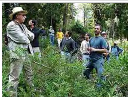
Foresters of UACH in the Valdivian forests of San Pablo de Tregua, Chile

Foresters work for the timber industry, government agencies, conservation groups, local authorities, urban parks boards, citizens' associations, and private landowners. The forestry profession includes a wide diversity of jobs, with educational requirements ranging from college bachelor's degrees to PhDs for highly specialized work. Industrial foresters plan forest regeneration starting with careful harvesting. Urban foresters manage trees in urban green spaces. Foresters work in tree nurseries growing seedlings for woodland creation or regeneration projects. Foresters improve tree genetics. Forest engineers develop new building systems. Professional foresters measure and model the growth of forests with tools like geographic information systems. Foresters may combat insect infestation, disease, forest and grassland