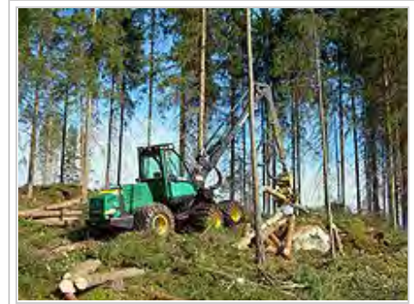
Timber harvesting, as here in Finland, is a common component of forestry

The practice of establishing tree plantations in the British Isles was promoted by John Evelyn, though it had already acquired some popularity. Louis XIV's minister Jean-Baptiste Colbert's oak Forest of Tronçais, planted for the future use of the French Navy, matured as expected in the mid-19th century: "Colbert had thought of everything except the steamship," Fernand Braudel observed. [15] In parallel, schools of forestry were established beginning in the late 18th century in Hesse, Russia, Austria-Hungary, Sweden, France and elsewhere in Europe.