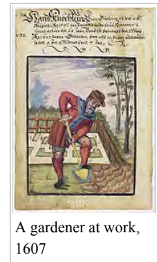
A gardener at work, 1607

Authentic gardens of the yeoman cottager would have included a beehive and livestock, and frequently a pig and sty, along with a well. The peasant cottager of medieval times was more interested in meat than flowers, with herbs grown for medicinal use rather than for their beauty. By Elizabethan times there was more prosperity, and thus more room to grow flowers. Even the early cottage garden flowers typically had their practical use—violets were spread on the floor (for their pleasant scent and keeping out vermin); calendulas and primroses were both attractive and used in cooking. Others, such as sweet william and hollyhocks, were grown entirely for their beauty. [8]