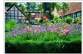
Garden at the Schultenhof in Mettingen, North Rhine-Westphalia, Germany