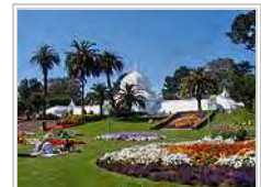
Conservatory of Flowers in Golden Gate Park, San Francisco