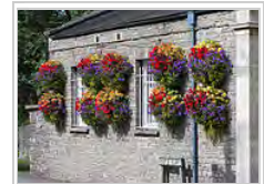
Hanging baskets in Thornbury, South Gloucestershire