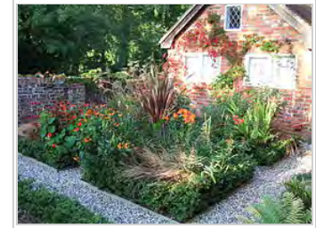
Part of a parterre in an English garden

Gardening ranges in scale from fruit orchards, to long boulevard plantings with one or more different types of shrubs, trees, and herbaceous plants, to residential yards including lawns and foundation plantings, to plants in large or small containers grown inside or outside. Gardening may be very specialized, with only one type of plant grown, or involve a large number of different plants in mixed plantings. It involves an active participation in the growing of plants, and tends to be labor-intensive, which differentiates it from farming or forestry.