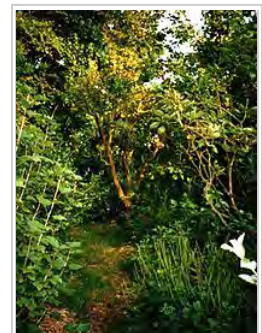
Robert Hart's forest garden in Shropshire, England

After the emergence of the first civilizations, wealthy individuals began to create gardens for aesthetic purposes. Egyptian tomb paintings from around 1500 BC provide some of the earliest physical evidence of ornamental horticulture and landscape design; they depict lotus ponds surrounded by symmetrical rows of acacias and palms. A notable example of ancient ornamental gardens were the Hanging Gardens of Babylon—one of the Seven Wonders of the Ancient World—while ancient Rome had dozens of gardens.