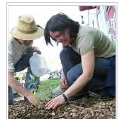
Planting in a garden

The key distinction between gardening and farming is essentially one of scale; gardening can be a hobby or an income supplement, but farming is generally understood as a full-time or commercial activity, usually involving more land and quite different practices. One distinction is that gardening is labor-intensive and employs very little infrastructural capital, sometimes no more than a few tools, e.g. a spade, hoe, basket and watering can. By contrast, larger-scale farming often involves irrigation systems, chemical fertilizers and harvesters or at least ladders, e.g. to reach up into fruit trees. However, this distinction is becoming blurred with the increasing use of power tools in even small gardens.