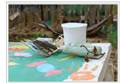
Hand gardening tools

Gardening for beauty is likely nearly as old as farming for food, however for most of history for the majority of people there was no real distinction since the need for food and other useful product trumped other concerns. Small-scale, subsistence agriculture (called hoe-farming) is largely indistinguishable from gardening. A patch of potatoes grown by a Peruvian peasant or an Irish smallholder for personal use could be described as either a garden or a farm. Gardening for average people evolved as a separate discipline, more concerned with aesthetics and recreation, under the influence of the pleasure gardens of the wealthy. Meanwhile, farming has evolved (in developed countries) in the direction of commercialization, economics of scale, and monocropping.