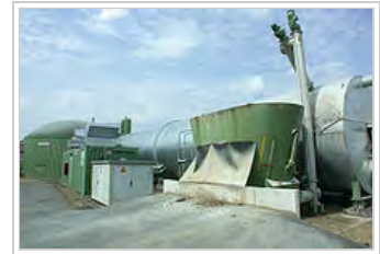
Pipes carrying biogas (foreground), natural gas and condensate

Biogas can be compressed, the same way natural gas is compressed to CNG, and used to power motor vehicles. In the UK, for example, biogas is estimated to have the potential to replace around 17% of vehicle fuel. [3] It qualifies for renewable energy subsidies in some parts of the world. Biogas can be cleaned and upgraded to natural gas standards, when it becomes bio-methane. Biogas is considered to be a renewable resource because its production-and-use cycle is continuous, and it generates no net carbon dioxide. Organic material grows, is converted and used and then regrows in a continually repeating cycle. From a carbon perspective, as much carbon dioxide is absorbed from the atmosphere in the growth of the primary bio-resource as is released when the material is ultimately converted to energy.