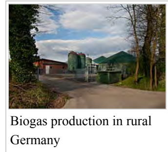
Biogas production in rural Germany

Biogas is produced as landfill gas (LFG), which is produced by the breakdown of Biodegradable waste inside a landfill due to chemical reactions and microbes, or as digested gas, produced inside an anaerobic digester. A biogas plant is the name often given to an anaerobic digester that treats farm wastes or energy crops. It can be produced using anaerobic digesters (air-tight tanks with different configurations). These plants can be fed with energy crops such as maize silage or biodegradable wastes including sewage sludge and food waste. During the process, the microorganisms transform biomass waste into biogas (mainly methane and carbon dioxide) and digestate. The biogas is a renewable energy that can be used for heating, electricity, and many other operations that use a reciprocating internal combustion engine, such as GE Jenbacher or Caterpillar gas engines. [4] Other internal combustion engines such as gas turbines are suitable for the conversion of biogas into both electricity and heat. The digestate is the remaining inorganic matter that was not transformed into biogas. It can be used as an agricultural fertiliser.