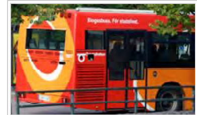
A biogas bus in Linköping, Sweden

Biogas can be used for electricity production on sewage works, [20] in a CHP gas engine, where the waste heat from the engine is conveniently used for heating the digester; cooking; space heating; water heating; and process heating. If compressed, it can replace compressed natural gas for use in vehicles, where it can fuel an internal combustion engine or fuel cells and is a much more effective displacer of carbon dioxide than the normal use in on-site CHP plants. [20]