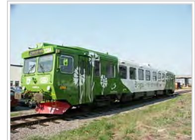
"Biogaståget Amanda" ("The Biogas Train Amanda") train near Linköping station, Sweden

If concentrated and compressed, it can be used in vehicle transportation. Compressed biogas is becoming widely used in Sweden, Switzerland, and Germany. A biogas-powered train, named Biogaståget Amanda (The Biogas Train Amanda), has been in service in Sweden since 2005. [28][29] Biogas powers automobiles. In 1974, a British documentary film titled Sweet as a Nut detailed the biogas production process from pig manure and showed how it fueled a custom-adapted combustion engine. [30][31] In 2007, an estimated 12,000 vehicles were being fueled with upgraded biogas worldwide, mostly in Europe. [32]