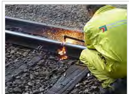
Propane oxygen burner used for cutting through steel rails