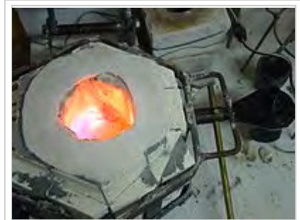
Propane burner used with forced air into a metal melting furnace.