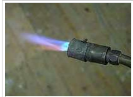
Propane burner with a Bunsen flame