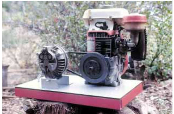
Above: This engine/generator uses a Chrysler 70 Ampere alternator.

Every RE system should have at least one power source capable of recharging the batteries at between C/10 to C/20 rates of charge. For example, a battery pack of 700 Ampere-hours periodically needs to be recharged at a minimum of 35 Amperes (its C/20 rate). To figure the C/20 rate for your pack, simply divide its