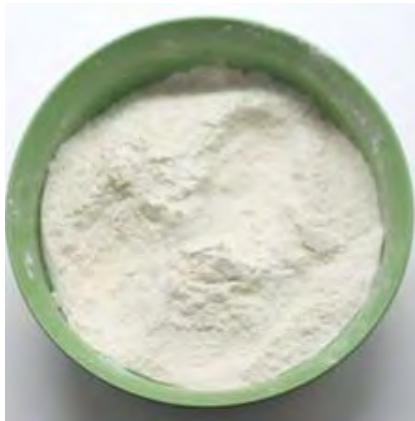
Uploaded 2 years ago