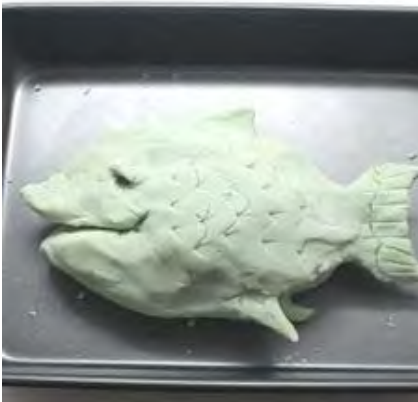
Uploaded 2 years ago