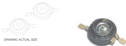
DRAWING ACTUAL SIZE

DESCRIPTION The power of Luxeon in its most basic form. Design and build your own Luxeon Light Source to your specifications. Luxeon Emitters available in white, green, cyan, blue, royal blue, red, red-orange, and amber. ○ ● ● ● ● ● ● ● ● ● ● ● ●