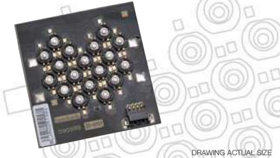
DRAWING ACTUAL SIZE

DESCRIPTION Rectangular array of 12 or 18 Luxeon light sources. Available in white, green, cyan, blue, red and amber. ○ ● ● ● ● ●