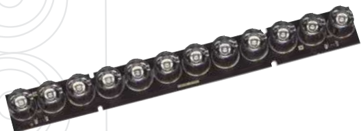
DRAWING ACTUAL SIZE

DESCRIPTION Linear array of 12 Luxeon light sources. Secondary optics for tight collimation included. Available in white, green, cyan, blue, red, and amber. ○ ● ● ● ● ● ● ● ● ● ● ● ●