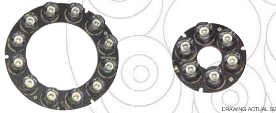
DRAWING ACTUAL SIZE

DESCRIPTION Circular arrays of 6 or 12 Luxeon light sources, that can either be used separately or in combination. Secondary optics for light collimation included. Available in white, green, cyan, blue, red and amber. ○ ● ● ● ● ●