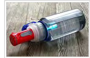
A portable, battery-powered, low-pressure mercury-vapor discharge lamp for water sterilization.

Ultraviolet disinfection of water is a purely physical, chemical-free process. Even parasites such as cryptosporidia or giardia , which are extremely resistant to chemical disinfectants, are efficiently reduced. [15] UV can also be used to remove chlorine and chloramine species from water; this process is called photolysis, and requires a higher dose than normal disinfection. The sterilized microorganisms are not removed from the water. UV disinfection does not remove dissolved organics, inorganic compounds or particles in the water. [16] However, UV-oxidation processes can be used to simultaneously destroy trace chemical contaminants and provide high-level disinfection, such as the world's largest indirect potable reuse plant in New York which opened the Catskill-Delaware Water Ultraviolet Disinfection Facility on 8 October 2013. A total of 56 energy-efficient UV reactors were installed to treat 2.2 billion US gallons (8,300,000 m 3 ) a day to serve New York City. [17]