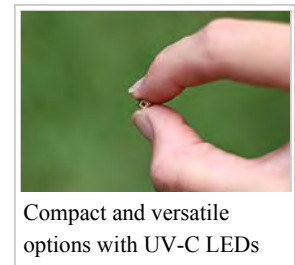
Compact and versatile options with UV-C LEDs