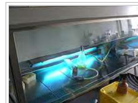
A low-pressure mercury-vapor discharge tube floods the inside of a biosafety cabinet with shortwave UV light when not in use, sterilizing microbiological contaminants from irradiated surfaces.

The application of UVGI to disinfection has been an accepted practice since the mid-20th century. It has been used primarily in medical sanitation and sterile work facilities. Increasingly it has been employed to sterilize drinking and wastewater, as the holding facilities are enclosed and can be circulated to ensure a higher exposure to the UV. In recent years UVGI has found renewed application in air purifiers.