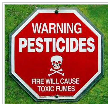
A sign warning about potential pesticide exposure.

Pesticides may cause acute and delayed health effects in people who are exposed. [28] Pesticide exposure can cause a variety of adverse health effects, ranging from simple irritation of the skin and eyes to more severe effects such as affecting the nervous system, mimicking hormones causing reproductive problems, and also causing cancer. [29] A 2007 systematic review found that "most studies on non-Hodgkin lymphoma and leukemia showed positive associations with pesticide exposure" and thus concluded that cosmetic use of pesticides should be decreased. [30] There is substantial evidence of associations between organophosphate insecticide exposures and neurobehavioral alterations. [31][32][33][34] Limited evidence also exists for other negative outcomes from pesticide exposure including neurological, birth defects, and fetal death. [35]