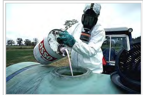
Preparation for an application of hazardous herbicide in USA.

Some pesticides are considered too hazardous for sale to the general public and are designated restricted use pesticides. Only certified applicators, who have passed an exam, may purchase or supervise the application of restricted use pesticides. [68] Records of sales and use are required to be maintained and may be audited by government agencies charged with the enforcement of pesticide regulations. [76][77] These records must be made available to employees and state or territorial environmental regulatory agencies. [78][79]