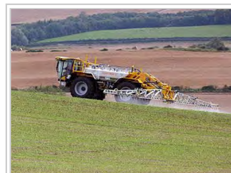
A Lite-Trac four-wheeled self-propelled crop sprayer spraying pesticide on a field