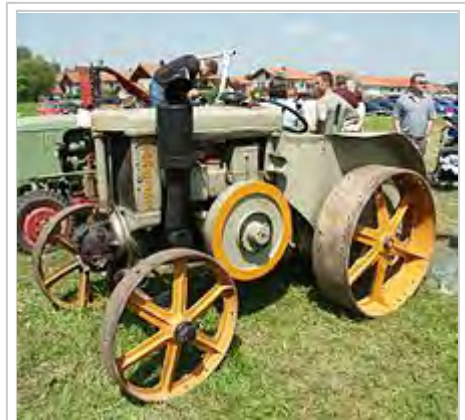
A Landini tractor with exposed flywheel.