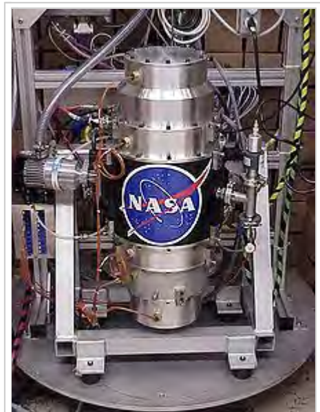
G2 Flywheel Module, NASA