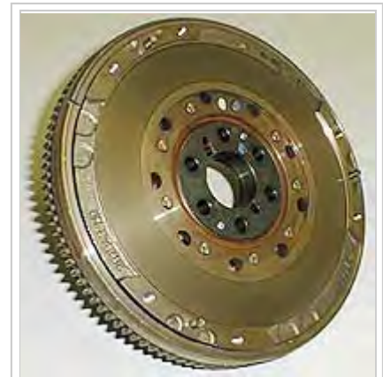
Modern automobile engine flywheel

where m denotes mass, and r denotes a radius.