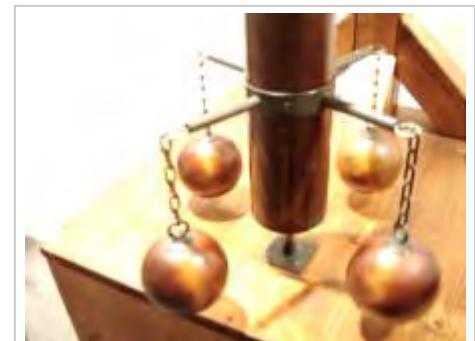
A flywheel with variable moment of inertia, conceived by Leonardo da Vinci.