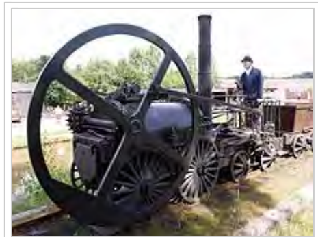
Trevithick's 1802 steam locomotive used a flywheel to even out the power of its single cylinder

Carbon-composite flywheel batteries have recently been manufactured and are proving to be viable in real-world tests on mainstream cars. Additionally, their disposal is more eco-friendly. [3]