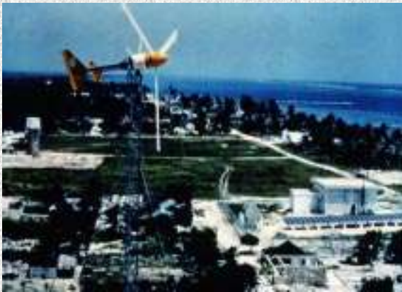
Xcalak hybrid power system - diesel retrofit completed in 1995