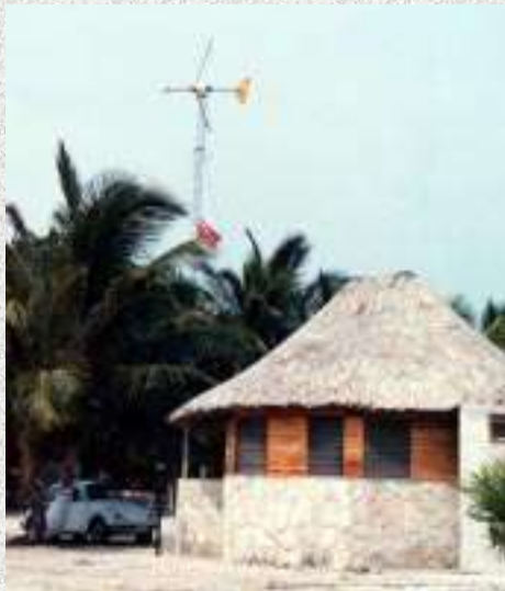
Costa de Cocos 11-kW wind-diesel hybrid system