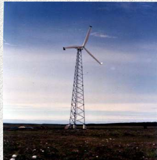
Atlantic Orient Corporation 50-kW wind turbine provides power to the Alaska Kotzebue Project.