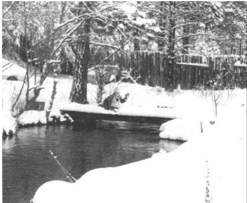
A quiet creek by a wilderness home.

from Plutarch's Lives, Themistocles (c. 528 - c. 462 B.C.)