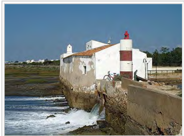
Tidal mill at Olhão, Portugal

A modern version of a tide mill is the electricity generating tidal barrage.