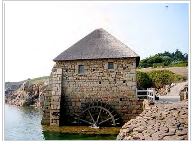
Tidal mill at l'île de Bréhat