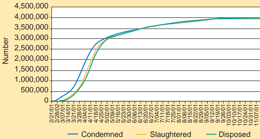
Figure 1. Cumulative Number of Animals Condemned, Slaughtered, and Disposed of During the 2001 FMD Outbreak in the UK

in place during the 1967 outbreak and placed major limitations to on-farm burial in many areas. Public health officials, the public, and the media raised concerns regarding the potential contamination of ground water from on-farm burial and air quality issues from pyres. While these concerns were being voiced, the outbreak continued to escalate. Carcass disposal could not keep pace with the rate that infected and exposed animals were being killed and farmers coped with the trauma of seeing the carcasses of their livestock for days, or in some cases weeks, prior to disposal (see Table 1). Officials needed to quickly develop alternative disposal options. These options included rendering, use of licensed commercial landfill sites, and the creation of mass burial sites – all new strategies for carcass disposal developed in the face of an escalating outbreak (see Figure 2).