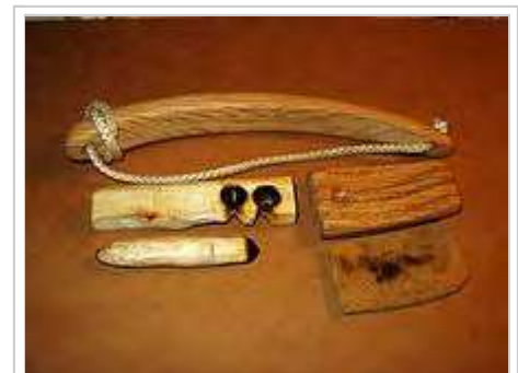
Miniature bowdrill kit

The word has been used in its current sense in Australia and South Africa at least as far back as the 1800s. Bush in this sense is probably a direct adoption of the Dutch 'bosch', (now 'bos') originally used in Dutch colonies for woodland and country covered with natural wood, but extended to usage in British colonies, applied to the uncleared or un-farmed districts, still in a state of nature. Later this was used by extension for the country as opposed to the town. In Southern Africa, we get Bushman