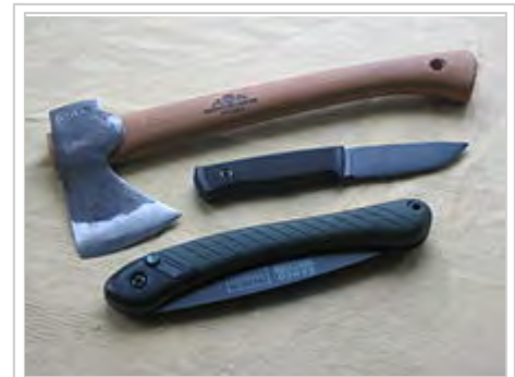
Knives, saws and axes are all popular bushcraft tools