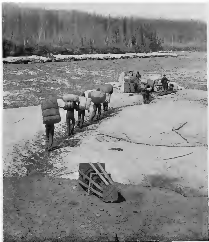
Indian voyageurs "packing" over long portage , each packet containing from fifty to one hundred pounds.