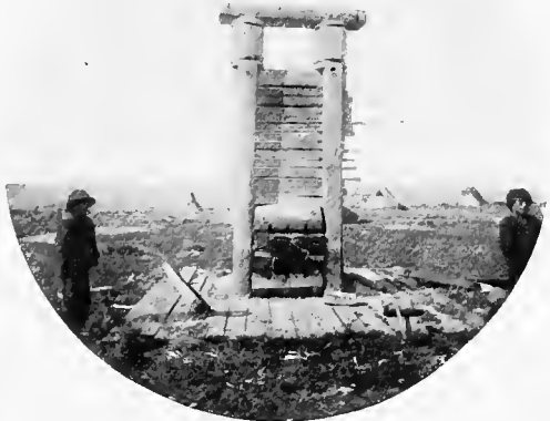
Types of Fur Presses.