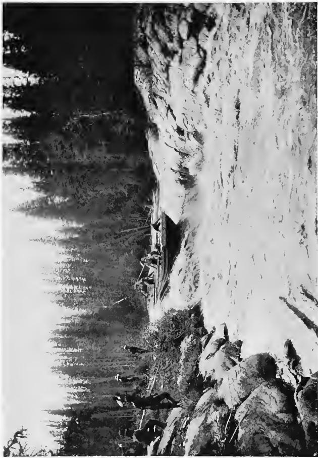
Traders running a mackinaw or keel-boat down the rapids of Slave River without unloading.