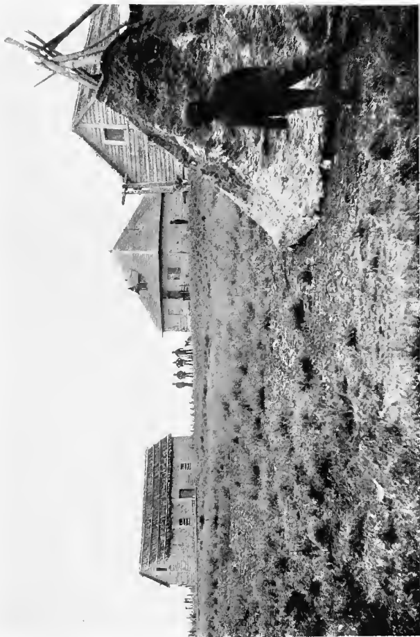
Fort MacPherson, now the most northerly post of the Hudson's Bay Company, beyond tree line; hence the houses are built of imported timber, with thatch roofs.