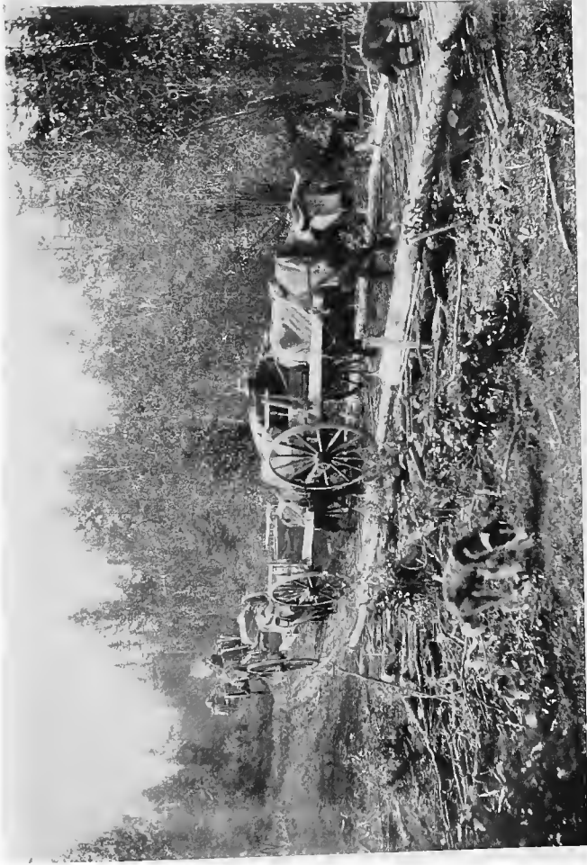
Carrying goods over long portage in MacKenzie River region with the old-fashioned Red River ox-carts.