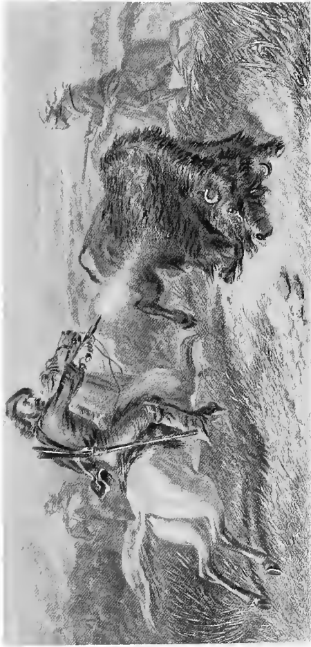
The buffalo-hunt. After a contemporary print.