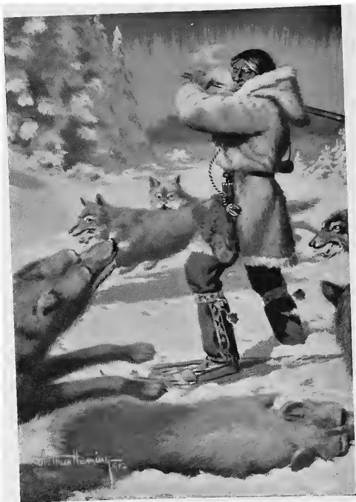
They dodge the coming sweep of the uplifted arm.