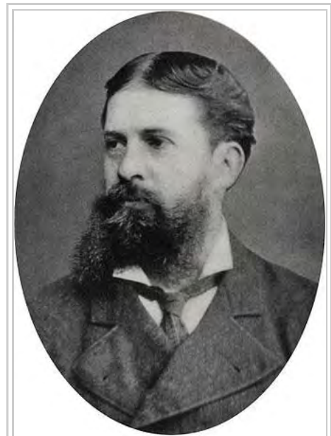
Charles Peirce ( / ˈ p ɜːr s / like "purse"): the American polymath who first identified pragmatism

Peirce developed the idea that inquiry depends on real doubt, not mere verbal or hyperbolic doubt, [12] and said, in order to understand a conception in a fruitful way, "Consider the practical effects of the objects of your conception. Then, your conception of those effects is the whole of your conception of the object", [2] which he later called the pragmatic maxim. It equates any conception of an object to the general extent of the conceivable implications for informed practice of that object's effects. This is the heart of his pragmatism as a method of experimental mental reflection arriving at conceptions in terms of conceivable confirmatory and disconfirmatory circumstances — a method hospitable to the generation of explanatory hypotheses, and conducive to the employment and improvement of verification. Typical of Peirce is his concern with inference to explanatory hypotheses as outside the usual foundational alternative between deductivist rationalism and inductivist empiricism, although he was a mathematical logician and a founder of statistics.