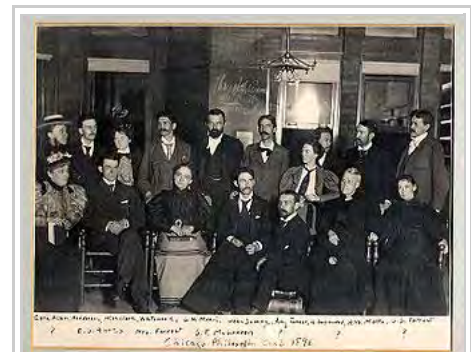
The "Chicago Club" including Mead, Dewey, Angell, and Moore. Pragmatism is sometimes called American Pragmatism because so many of its proponents were and are Americans.

[A young graduate] began by saying that he had always taken for granted that when you entered a philosophic classroom you had to open relations with a universe entirely distinct from the one you left behind you in the street. The two were supposed, he said, to have so little to do with each other, that you could not possibly occupy your mind with them at the same time. The world of concrete personal experiences to which the street belongs is multitudinous beyond imagination, tangled, muddy, painful and perplexed. The world to which your philosophy-professor introduces you is simple, clean and noble. The contradictions of real life are absent from it. [...] In point of fact it is far less an account of this actual world than a clear addition built upon it [...] It is no explanation of our concrete universe (James 1907, pp. 8–9)