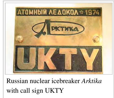
Russian nuclear icebreaker Arktika with call sign UKTY

Leisure craft with VHF radios may not be assigned call signs, in which case the name of the vessel is used instead. Ships in the US wishing to have a radio licence anyway are under F.C.C. class SA: "Ship recreational or voluntarily equipped." Those calls follow the land mobile format of the initial letter K or W followed by 1 or 2 letters followed by 3 or 4 numbers (such as KX0983 or WXX0029). U.S. Coast Guard small boats have a number that is shown on both bows (i.e. port and starboard) in which the first two digits indicate the nominal length of the boat in feet. For example, Coast Guard 47021 refers to the 21st in the series of 47 foot motor lifeboats. The call sign might be abbreviated to the final two or three numbers during operations, for example: Coast Guard zero two one .