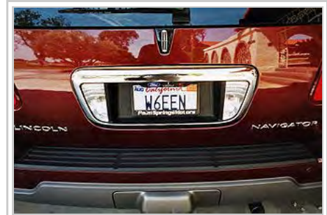
All U.S. states issue call sign license plates for motor vehicles owned by amateur radio operators. This road vehicle is from California.

In the British military, tactical voice communications use a system of call signs of the form letter-digit-digit . Within a standard infantry battalion these characters represent companies, platoons and sections respectively, so that 3 Section, 1 Platoon of F Company might be F13. In addition, a suffix following the initial call sign can denote a specific individual or grouping within the designated call sign, so F13C would be the Charlie fire team. Unused suffixes can be used for other call signs that do not fall into the standard call sign matrix, for example the unused 33A call sign is used to refer to the Company Sergeant Major.