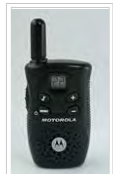
Motorola FV150 FRS and GMRS handheld radio