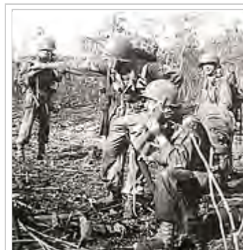
Noemfoor, Dutch New Guinea, July 1944. A US soldier (foreground) uses a Handie-Talkie during the Battle of Noemfoor.

Walkie-talkies are widely used in any setting where portable radio communications are necessary, including business, public safety, military, outdoor recreation, and the like, and devices are available at numerous price points from inexpensive analog units sold as toys up to ruggedized (i.e. waterproof or intrinsically safe) analog and digital units for use on boats or in heavy industry. Most countries allow the sale of walkie-talkies for, at least, business, marine communications, and some limited personal uses such as CB radio, as well as for amateur radio designs. Walkie-talkies, thanks to increasing use of miniaturized electronics, can be made very small, with some personal two-way UHF radio models being smaller than a deck of cards (though VHF and HF units can be substantially larger due to the need for larger antennas and battery packs). In addition, as costs come down, it is possible to add advanced squelch capabilities such as CTCSS (analog squelch) and DCS