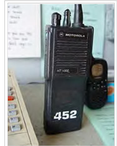
A Motorola HT1000 two-way radio

Consumer and commercial equipment differ in a number of ways; commercial gear is generally ruggedized, with metal cases, and often has only a few specific frequencies programmed into it (often, though not always, with a computer or other outside programming device; older units can simply swap crystals), since a given business or public safety agent must often abide by a specific frequency allocation. Consumer gear, on the other hand, is generally made to be small, lightweight, and capable of accessing any channel within the specified band, not just a subset of assigned channels.