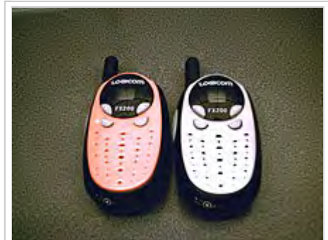
Two consumer-grade walkie-talkies (PMR446-type)