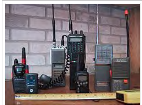
Recreational, toy and amateur radio walkie-talkies

A walkie-talkie is a half-duplex communication device; multiple walkie-talkies use a single radio channel, and only one radio on the channel can transmit at a time, although any number can listen. The transceiver is normally in receive mode; when the user wants to talk he presses a "push-to-talk" (PTT) button that turns off the receiver and turns on the transmitter. Typical walkie-talkies resemble a telephone handset, possibly slightly larger but still a single unit, with an antenna mounted on the top of the unit. Where a phone's earpiece is only loud enough to be heard by the user, a walkie-talkie's built-in speaker can be heard by the user and those in the user's immediate vicinity. Hand-held transceivers may be used to communicate between each other, or to vehicle-mounted or base stations.