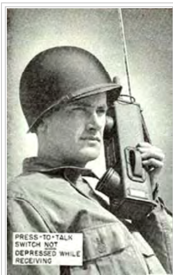
A SCR-536 "handie talkie", the first walkie-talkie.