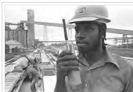
A USDA grain inspector with RCA TacTec walkie-talkie, New Orleans, 1976

Intrinsically safe walkie-talkies are often required in heavy industrial settings where the radio may be used around flammable vapors. This designation means that the knobs and switches in the radio are engineered to avoid producing sparks as they are operated.