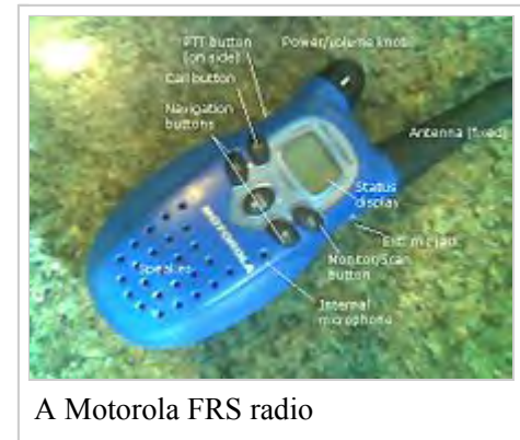
A Motorola FRS radio

Most personal walkie-talkies sold are designed to operate in UHF allocations, and are designed to be very compact, with buttons for changing channels and other settings on the face of the radio and a short, fixed antenna. Most such units are made of heavy, often brightly colored plastic, though some more expensive units have ruggedized metal or plastic cases. Commercial-grade radios are often designed to be used on allocations such as GMRS or MURS (the latter of which has had very little readily available purpose-built equipment). In addition, CB walkie-talkies are available, but less popular due to the propagation characteristics of the 27 MHz band and the general bulkiness of the gear involved.