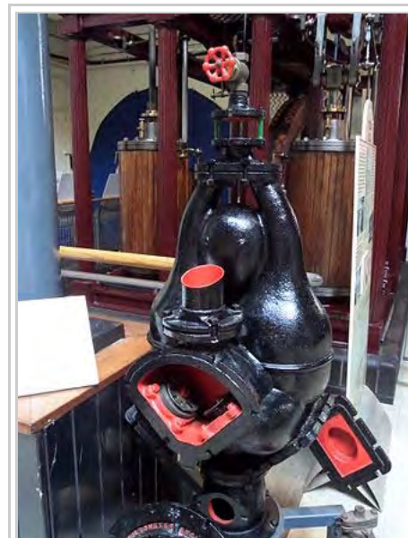
Pulsometer pump at the London Museum of Water & Steam

from the boiler, for, in accordance with the inventor's first specifications, the steam pipe is small. If now the pressure in the left chamber is equal, or nearly equal, to that in the right, friction caused by the rapid flow of steam past the ball will draw the ball over and close the right-hand chamber. Cut off from further supply, the steam, in contact with water, begins to condense; a jet of cold water from the discharge pipe spurts up through the injection tube, and by breaking into spray against the side of the steam space, completes the condensation. The partial vacuum produced brings water through the suction valve to fill the chamber; but at the same time the air valve admits a little air, which passes up ahead of the water and forms an elastic cushion to prevent the water from striking violently against the steam ball. The air chamber is for the purpose of preventing water-hammer in the suction pipe.