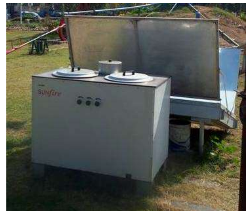
A collector cooker. Mirrors are added to increase the amount of sunlight falling on the collector.

Collector cookers consist of two parts. A collector and a cooking range. The collector can be placed outdoors, while the cooking range can be located in the kitchen. These cookers make use of diffuse and direct solar radiation. They are, however, rather complicated to build. The collector cooker can use air or steam for the heat collection, but also a liquid like oil can be used. In that case, the heat can be stored for a short period of time. This period is often not long enough to be able to cook in the evening. Temperatures of up to 150 °C can be reached when a liquid like oil is used. These types of cookers are typically expensive compared to the other types.