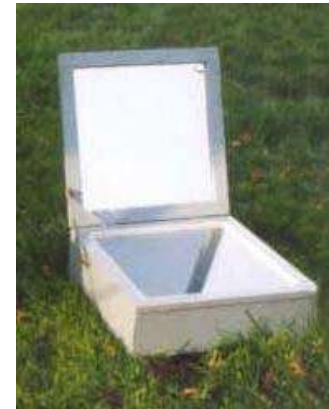
A box cooker.

The box type solar cooker doesn't reach very high temperatures (no frying or roasting is possible) and should remain closed during cooking, which makes stirring or adding of ingredients impossible. Therefore, the solar box cooker can be used to prepare for example rice or lentils over a time period of a few hours during the day when the user is out at work. When the user returns the food will be ready.