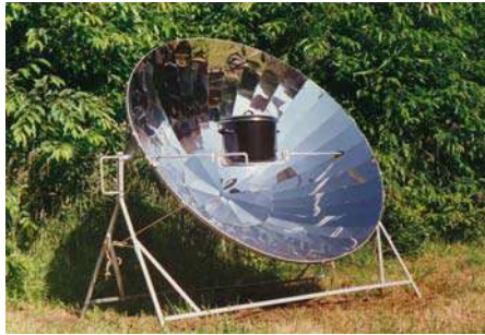
A parabolic solar cooker.