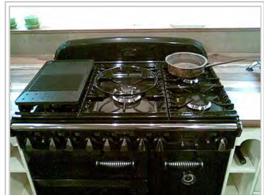
A kitchen stove with oven that operates using flammable gas