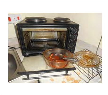
A bachelor griller, with cooking stains