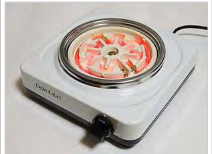
A hotplate-style electric tabletop burner