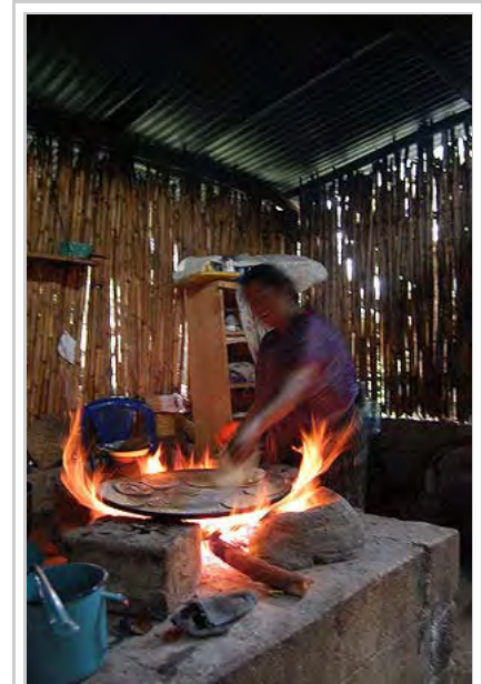
Cooking tortillas (flatbread) on a wood-fired 3-stone cook stove