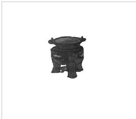
A brazier style of tea stove