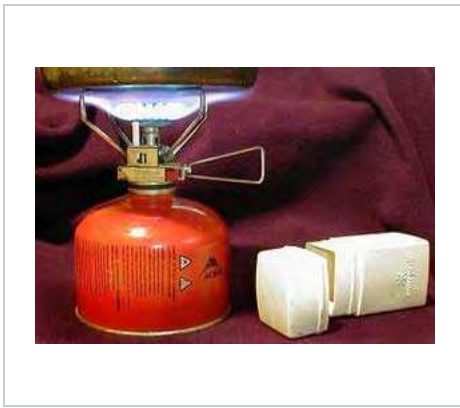
A small portable stove running on MSR gas and the stove's carrying case