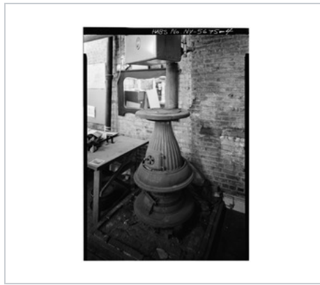
A potbelly stove at a museum in New York