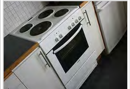
An electric stove