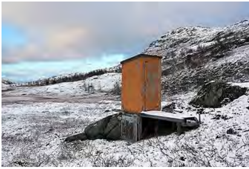
Outhouse in the mountains in northern Norway