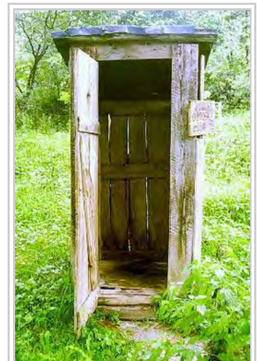
Outhouse with squat toilet inside