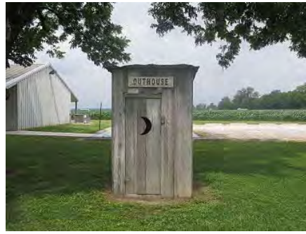
Outhouse used by sharecroppers on display, Louisiana State Cotton Museum, Lake Providence