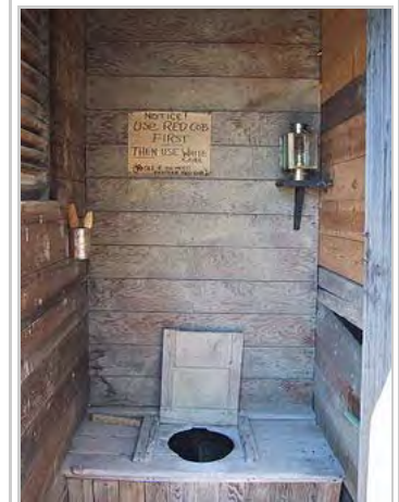
Interior of an 1880s example near Stamford, South Dakota, showing seat with cover and a louvered vent to one side

Outhouses are typically built on one level, but two-story models are to be found in unusual circumstances. One double-decker was built to serve a two-story building in Cedar Lake, Michigan. The outhouse was connected by walkways. It still stands (but not the building). [n 2] The waste from "upstairs" is directed down a chute separate from the "downstairs" facility in these instances, so contrary to various jokes about two-story outhouses, the user of the lower level has nothing to fear if the upper level is in use at the same time.