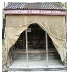
Triple-seated outhouse, Wauchope, New South Wales, Australia