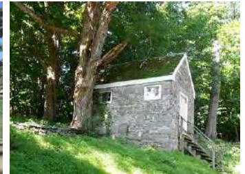
Eight-seat stone outhouse at the Thomas Leiper Estate near Wallingford, Pennsylvania