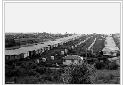
Norman Park, Queensland, around 1950; like many areas of Brisbane this area was unsewered until the late 1960s, with each house having an outhouse or "dunny" in the back yard. The little sheds in each back yard are outhouses.

Some outhouses were built surprisingly ornate, almost opulent, considering the time and the place. [48] For example, an opulent 19th century antebellum example (a three-holer) is at the plantation area at the state park in Stone Mountain, Georgia. [49] The outhouses of Colonial Williamsburg varied widely, from simple expendable temporary wood structures to high-style brick. [50] See Jefferson's matched pair of eight-sided brick privies. [50] Thomas Jefferson designed and had built two brick octagons at his vacation home. [50] Such outhouses are sometimes considered to be overbuilt, impractical and ostentatious, giving rise to the simile "built like a brick shithouse." That phrase's meaning and application is subject to some debate; but (depending upon the country) it has been applied to men, women, or inanimate objects.