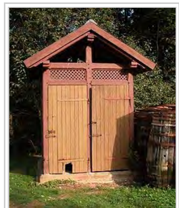
School outhouse from Portz, Germany, about 1900, now at the Roscheider Hof Open Air Museum