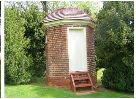
A brick outhouse at Thomas Jefferson's Poplar Forest estate near Lynchburg, Virginia