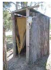
Outhouse at Walcha, New South Wales, Australia