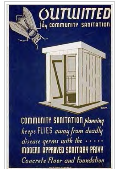
Historical community sanitation poster promoting sanitary outhouse designs (Illinois, U.S., 1940)