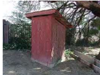
Outhouse used in the 19th century: Manistee Ranch in Glendale, Arizona, U.S.