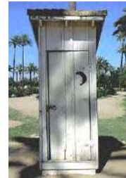
Outhouse used in the 19th century: Sahuaro Ranch in Glendale, Arizona, U.S.