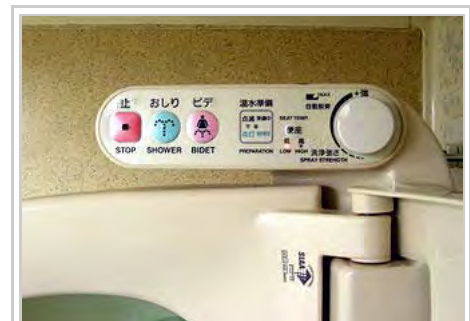
View of control element in a modern Japanese washlet