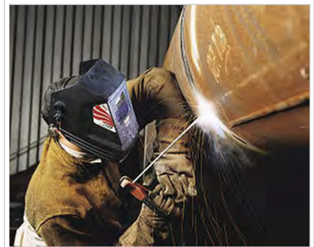
Shielded metal arc welding

An electric current, in the form of either alternating current or direct current from a welding power supply, is used to form an electric arc between the electrode and the metals to be joined. The workpiece and the electrode melts forming a pool of molten metal (weld pool) that cools to form a joint. As the weld is laid, the flux coating of the electrode disintegrates, giving off vapors that serve as a shielding gas and providing a layer of slag, both of which protect the weld area from atmospheric contamination.