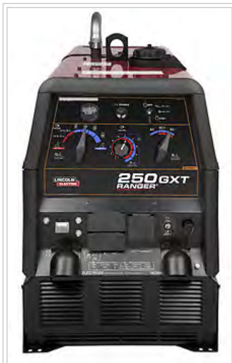
A high output welding power supply for Stick, GTAW, MIG, Flux-Cored, & Gouging

The preferred polarity of the SMAW system depends primarily upon the electrode being used and the desired properties of the weld. Direct current with a negatively charged electrode (DCEN) causes heat to build up on the electrode, increasing the electrode melting rate and decreasing the depth of the weld. Reversing the polarity so that the electrode is positively charged (DCEP) and the workpiece is negatively charged increases the weld penetration. With alternating current the polarity changes over 100 times per second, creating an even heat distribution and providing a balance between electrode melting rate and penetration. [19]