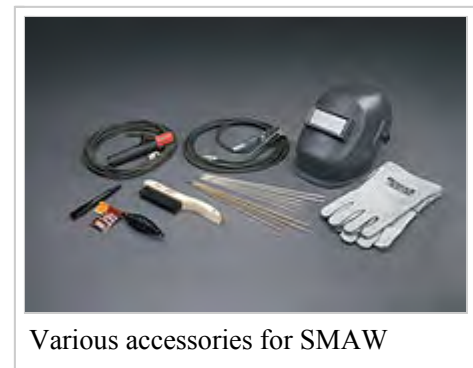
Various accessories for SMAW

The choice of electrode for SMAW depends on a number of factors, including the weld material, welding position and the desired weld properties. The electrode is coated in a metal mixture called flux, which gives off gases as it decomposes to prevent weld contamination, introduces deoxidizers to purify the weld, causes weld-protecting slag to form, improves the arc stability, and provides alloying elements to improve the weld quality. [22] Electrodes can be divided into three groups—those designed to melt quickly are called "fast-fill" electrodes, those designed to solidify quickly are called "fast-freeze" electrodes, and intermediate electrodes go by the name "fill-freeze" or "fast-follow" electrodes. Fast-fill electrodes are designed to melt quickly so that the welding speed can be maximized, while fast-freeze electrodes supply filler metal that solidifies quickly, making welding in a variety of positions possible by preventing the weld pool from shifting significantly before solidifying. [23]