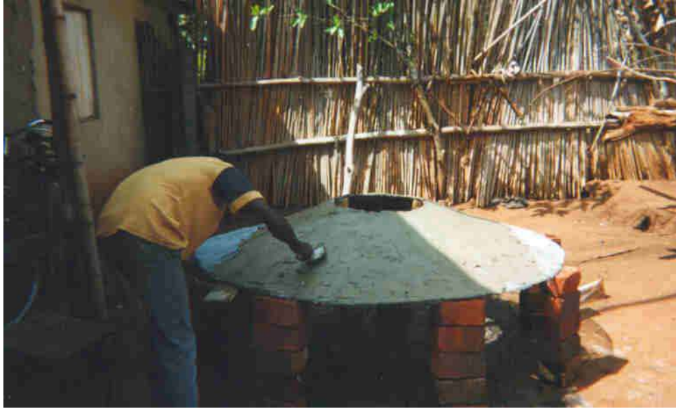
Figure 9 – Thin-shell ferrocement cover being manufacture for partially below-ground tank in western Uganda

Further information and test results form this work will be included in Milestone A5 report.