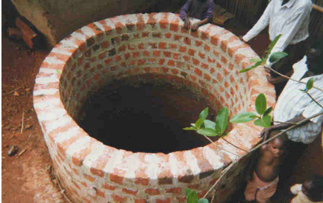
Figure 7 – Bird's eye view of the partially below-ground tank under construction.

Figures 7, and 8 below, show the partially below ground tank under construction, while Figure 9 shows the thin shell ferrocement cover being manufactured.