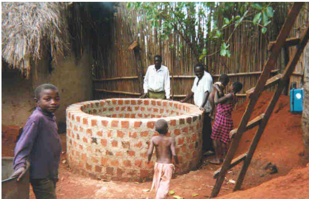
Figure 8 – Partially below ground tank under construction in western Uganda, showing parapet wall.