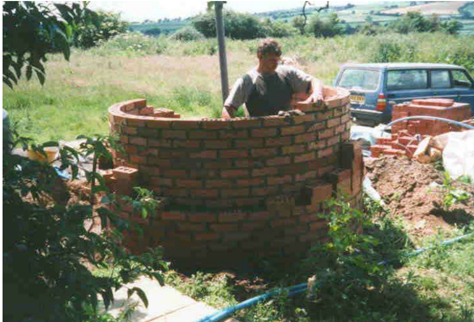
Figure 3 – Full-size experimental tank under construction at field site.