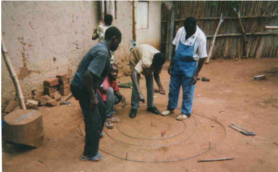
Figure 10 – 6mm steel framework being formed by local masons in western Uganda for the TSF tank cover.