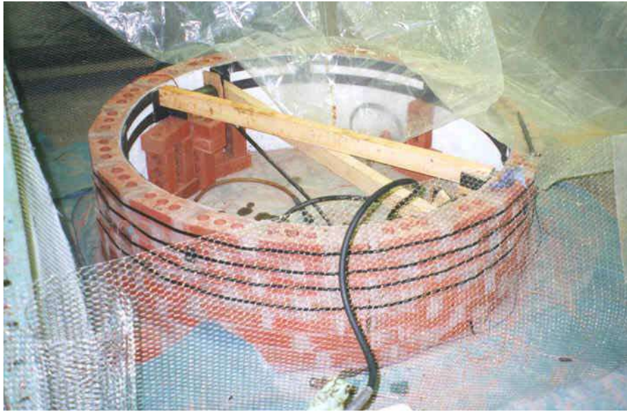
Figure 1 – Tests arrangement for externally reinforced brick cylinders