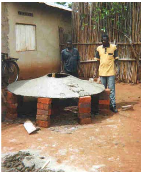
Figure 11 – TSF cover being completed by local mason in western Uganda. This cover was fitted to a partially below-ground tank.

Tests have been carried out on the cover to determine its strength and the results are shown in appendix 2.