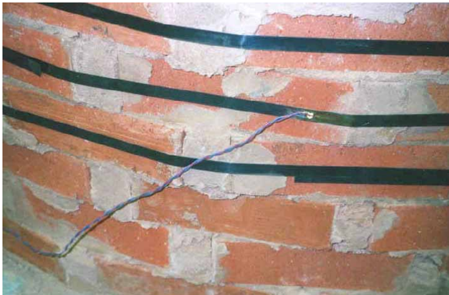
Figure 2 – Strain gauge used to measure hoop stress generated in steel strap during testing.

Future work in this area will include research into the use of cement stabilised soil blocks in place of brick, used in conjunction with a plastic tank liner, with the aim of reducing costs further.