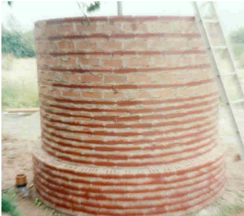
Figure 4 – Strapping applied to experimental tank.

Results of the tests carried out at the University and at the field site will be reported in Milestone A5.