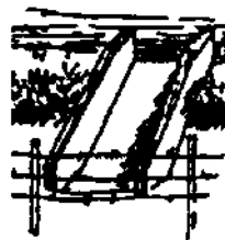
Figure 12: Outlet

This is a channel built to guide excess water out of the waterhole without eroding its lower banks. If the waterhole is operating normally, any overflow should leave the pond by this outlet. Whilst always desirable, it is not essential, especially if the pond normally fills up by floodwater entering from all directions.