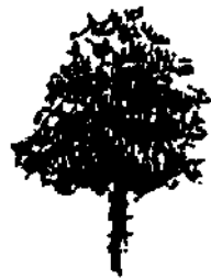
Figure 15: Trees for shadow

Trees planted around the waterhole will serve as a windbreak (see figure 9). The shade they cast will help to reduce evaporation. Advantage should be taken of the fact that the area is fenced to make the most of these plantations. Fruit trees serve the purpose well and add to the value of the project, as will certain forage species. Very water-demanding species such as neem and eucalyptus should be avoided however. A belt of trees around the waterhole will create pleasant and cooler surroundings for the animals, and their herders, to relax in.