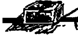
Figure 13: Pump

tenance. It should, if possible, be reserved uniquely for waterhole use. It may be that influential local people are tempted to use it to irrigate their crops or pump from their well, but this sort of use by individuals should be prohibited by the waterhole regulations, or a rental arrangement should be organised.