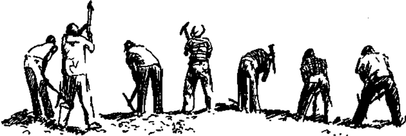
Figure 5: Digging a waterhole using labour-intensive methods.

The requirement that the animals should not be allowed to enter the water to drink imposes a certain waterhole design. The extensionist could suggest a design based on figure 7, with a choice of options.