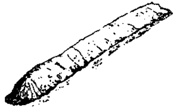
Figure 10: Earth bank

20 metres from the edges of the waterhole an earthen bank should be erected, across the prevailing winds, using the spoils from the excavation work. This will help reduce evaporation rates. If there is a danger that the soil from the bank might erode towards the water, a ditch should be dug at the foot of the bank.