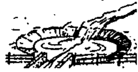
Figure 8: Decantation pond

This is a pond just upstream of the waterhole. It will slow down the flow and force silt and debris carried by the water to drop to the bottom before entering the waterhole. If this pond is regularly cleaned out, and it is recommended to do so once a year, the waterhole will not silt up too quickly. This can either be done by the users themselves or by a workforce paid out of the waterhole budget.