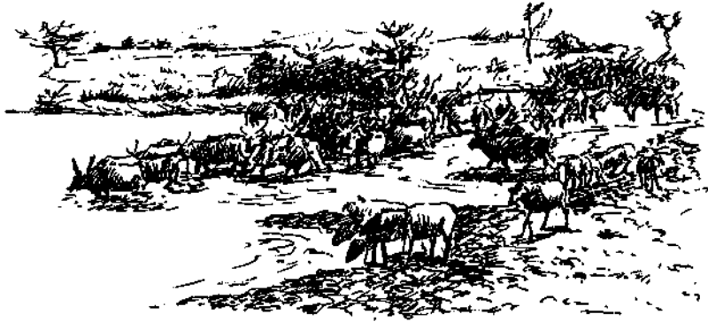
Figure 3: Stock (cattle and sheep) with direct access to the water.

Artificial waterpoints are seen as everyone's property when it comes to watering animals – and nobody's when it comes to maintaining them.