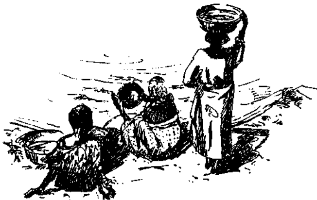
Figure 1: Carrying water for family consumption.

In the sudano-sahelian zone, farmers and stockkeepers have to contest with difficult climatic conditions, ranging from floods and waterlogging in the rainy season to unreliable rains and heavy evaporation of surface water in the dry season.