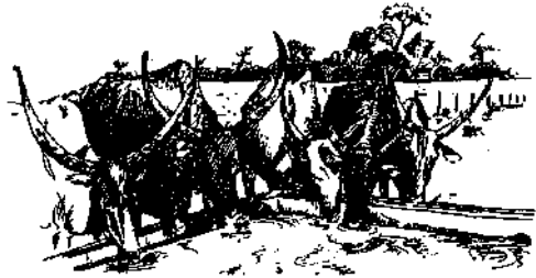
Figure 9: Cattle at drinking troughs

These should be made of reinforced and sealed concrete. Their number depends on the number of animals to be watered at any one time. They should not be too high for the smaller ruminants and younger animals. To hold a maximum amount of water they should be set up on level ground. Ideally there should be a proper system for draining them (See figure 9).