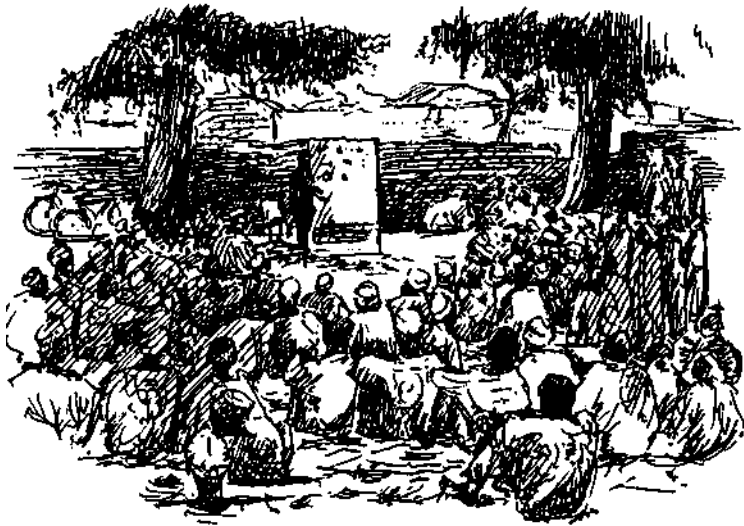
Figure 16: Meeting of waterpoint users.

These questions will have to be raised by the extensionist; and answers will have to be provided by the users. Extensionists can give their opinion on the matter, to help the discussion (figure 16).