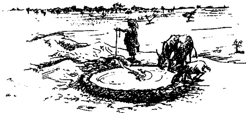
Figure 2: Traditional well with clay drinking trough at Kerawa (North Cameroon)

by Minepia (the Ministry for Livestock, Fisheries and Animal Industry), the drilling and rehabilitation of 2000 boreholes by Vergnet/FORACO, and the installation of 700 retention systems in the Mandara mountains, by the diocese development committee and the Group of organisations working on catchment development. This investment certainly resulted in progress, but it has not been able to satisfy all of these villages' water requirements.