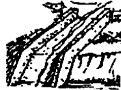
Figure 14: Spillway

A spillway is a masonry dam over which the water must flow to cross into the waterhole from the decantation pond. Without a spillway the water will erode the banks of the waterhole. All water entering the waterhole must do so across this spillway.