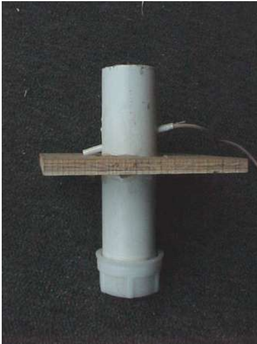
The finished float switch