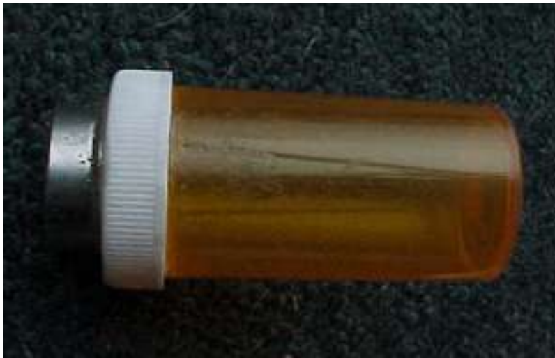
Float with magnet glued on top

So far the new switch has been very reliable. It took a bit of adjustment to get the magnet to trigger the reed switch without sticking to it and holding the float up when the water level dropped. All in all this was about a 2 hour project, including epoxy drying time. Total cost was ZERO for me, since all the parts were from my junk bin. New, the reed switch would cost less than a dollar, same for the magnet.