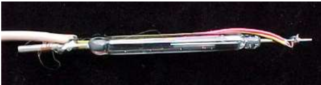
Magnetic reed switch