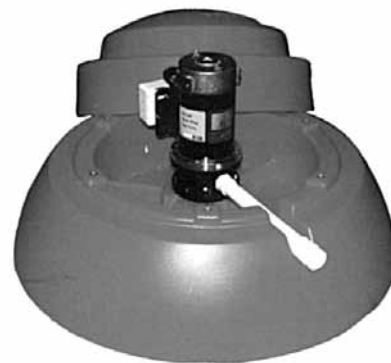
This floating pump consists of a Mono Sunray pump mounted on a floating pontoon.

A third method is to use a wind turbine to compress air, which can then be used to drive a pump of some sort. Two examples of home-built pumps of this type appeared in issue 66 of ReNew .