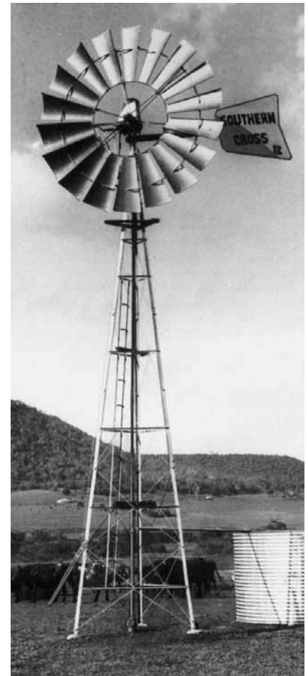
A Southern Cross windmill pumping system, very common in rural areas in Australia.

In general, the pumps known as positive displacement pumps will have higher efficiencies than centrifugal types, especially when pumping to high heads, so if getting the most out of your solar panel pumping system is impor-