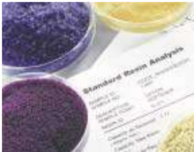
Periodic resin testing ensures optimum performance