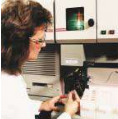
State-of-the-art laboratory testing