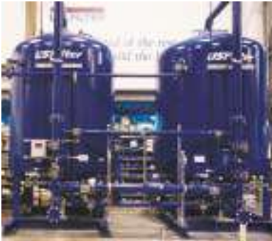
USFilter offers the total solution to all your resin needs.

USFilter has the experience and knowledge to help prolong the useful life of your resin and to also determine when it is more economical to replace the resin. Let USFilter and our technical staff optimize your system today!