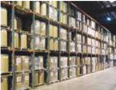
Largest inventory of resin allows 24 hour shipment of any resin in stock