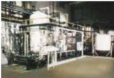
Resin regeneration facility in Rockford, IL