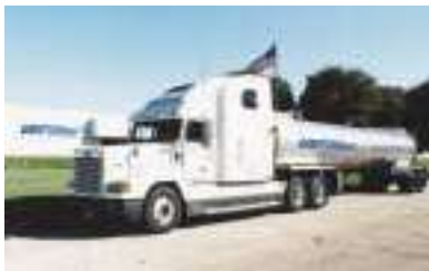
USFilter resin tanker

From resin processing and resin disposal to system performance optimization, our specialty resin services are designed to help you operate your plant efficiently and cost effectively.