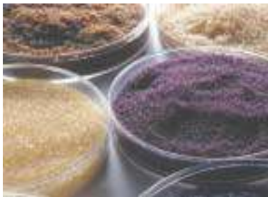
USFilter's diverse inventory of resin

rigorous requirements. With USFilter brand resins, you are assured of the highest quality product. And, since USFilter is the largest user and supplier of ion exchange resin in North America, we are able to use our purchasing strength to provide USFilter brand resins at very competitive prices.