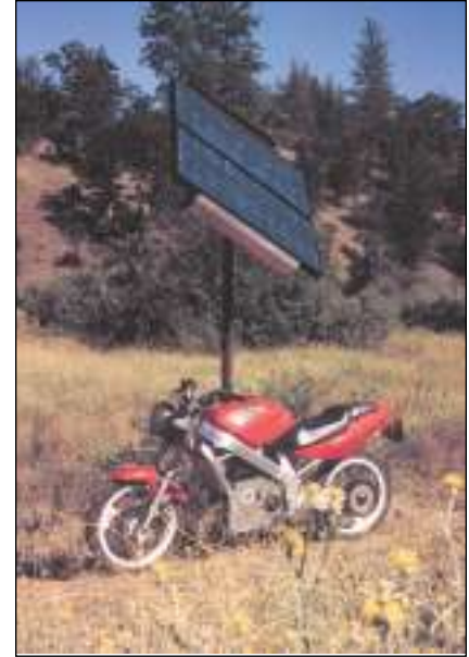
Solar panels recharge an electric motorcycle miles from grid power.

My research also revealed that, in 1900, steam cars and electric cars had dominated the roads. An electric-powered vehicle? I daydreamed about