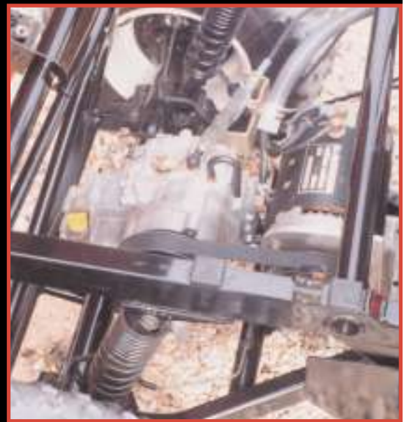
A gearbelt delivers motor power to the stock transmission, eliminating the less efficient infinite ratio drive unit.

What did it all cost? The basic conversion kit ($2,160), battery pack ($600), DC-DC converter ($190), and miscellaneous hardware and aluminum angle ($250) totaled $3,200. Add to this 30 hours of Tom's time. And this was a prototype!