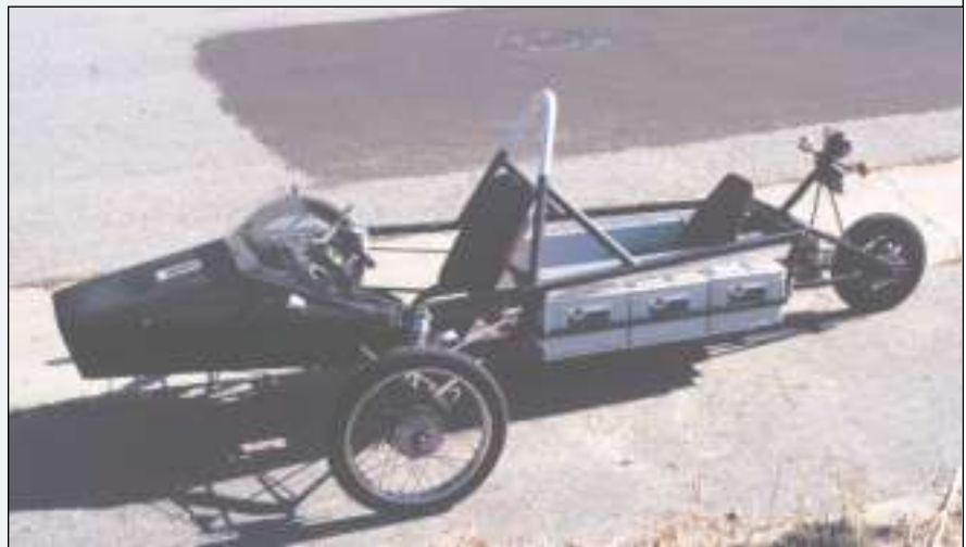
Right: The Speedster II is a good runabout.

The vehicle can be arranged as a standard 4-wheeled EV or as a motorbike (3-wheels). In the 4-wheeled configuration, the FRW (front-to-rear weight) ratio is 1:1, with the rear wheels driven through a simple lawnmower (seated type) differential. In the 3-wheeled layout, the two front wheels are both steered and powered. Maintain a FRW (front-to-rear) ratio of 4:1 for good stability. With this low a vehicle weight, the rear wheel supports too little weight for good traction during acceleration or regen braking, hence the preference for front-wheel drive.