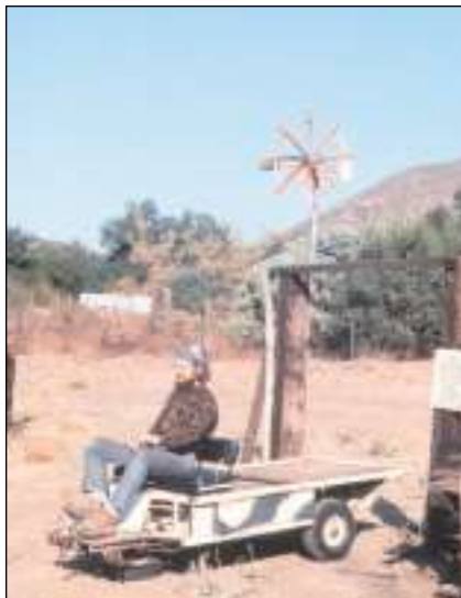
Wind-generated electricity was used to recharge Ox.

plugging a car into one of my wind-electric machines. A few months later, this dream came true with Ox, my first EV. I was driving on wind-watts! I had found an alternative to the ICE car and gasoline.